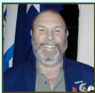
PP Ian Critchley Foundation