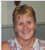
Rtn. Veronica Burns Community

Garage Sales are an on-going event. Club members encouraged to assist any time, see Mike for info. Furniture-On-Line, good weekend, shop almost full of stock. Showroom status now means we can invite customers to view and purchase our stock. Help needed Thu, Fri and Saturday, Bread project, now delivering to 5 local schools.