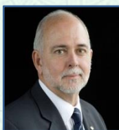
Rotary International President 2018/19