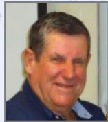
PP Max Bird Foundation Dir.