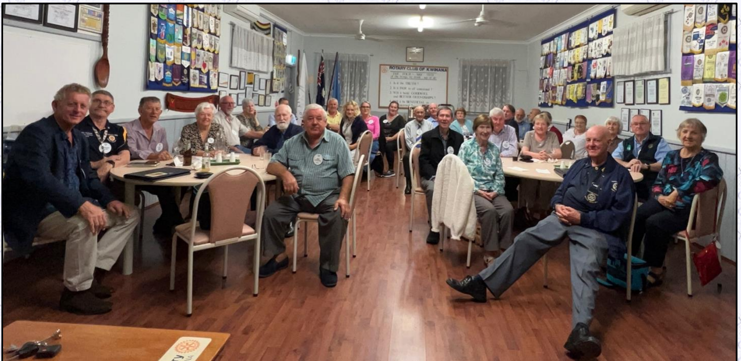
Meeting at Rotary Hall, Monday 20 th May 2024

I went to buy some camouflage pants but couldn't find any. I know they say that money talks, but all mine says is 'Goodbye.' I used to think I was indecisive. But now I'm not so sure. People who use selfie sticks really need to have a good, long look at themselves.