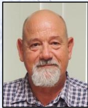
Peter Schulz Vocational

https://www.youtube.com/watch?v= XIiqta0b6I