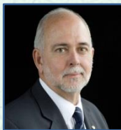
Rotary International President 2018/19

District Training Assembly this coming Sunday 19 th May at the North Lake Senior Campus from 8.30 am – 1 pm, incoming office bearers are expected to attend while any other interested members are most welcome.