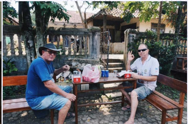
Good to see the workers enjoying a meal at some stage!