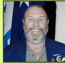
PP Ian Critchley Foundation