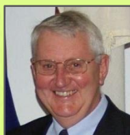
PP James Sharkey Public Relations

Visit your club webpage. http://www.clubrunner.ca/Portal/Home.aspx?accountid=8106 or type Kwinana Rotary Club into "Google"