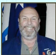
PP Ian Critchley Foundation