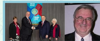
District Governor 9465