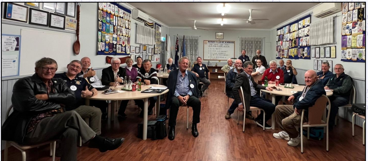
Meeting at Rotary Hall, Monday 10 th June 2024