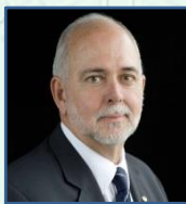
Rotary International President 2018/19