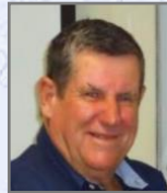
PP Max Bird Foundation Dir.