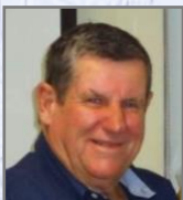
PP. Max Bird International

Pam Brookes has suggested that we could provide an Australian Flag to Gracehaven Village for use on Anzac Day.