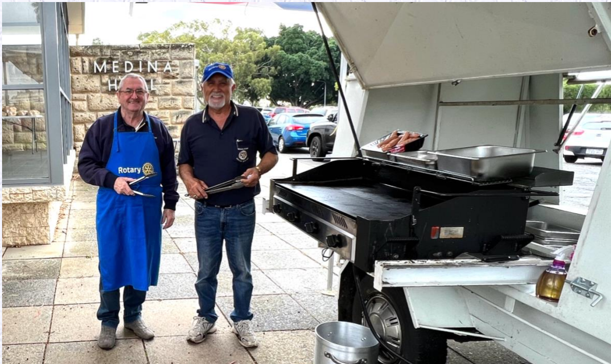
The crew at the Reconciliation BBQ at Medina Hall, Wednesday 31 st May 2023