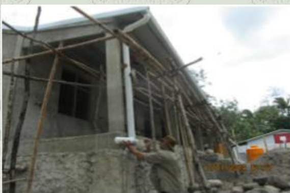
PVC piping being installed