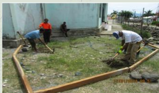
Preparing the hardstand for tanks