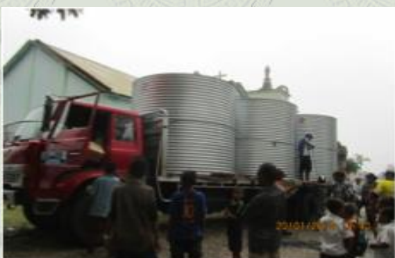
Other three tanks arrive