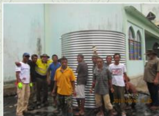
First tank in place