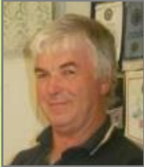
Norm Mulcahy Community