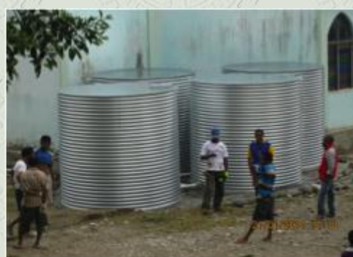
All tanks now installed