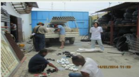
Sorting out the fittings

Task: to install a rain water harvesting system at the Baguia Orphanage, Proudly sponsored by the Rotary Clubs of Kwinana, Southern Districts, Byford, Palm Beach and Rockingham utilising the new school roof currently being built by others.