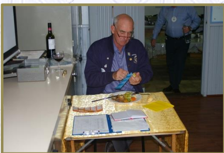
The Club Beavers