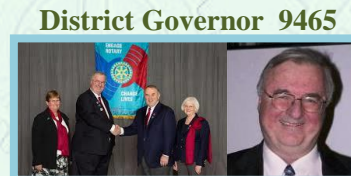
District Governor 9465