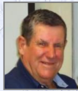
PP Max Bird Foundation Dir.