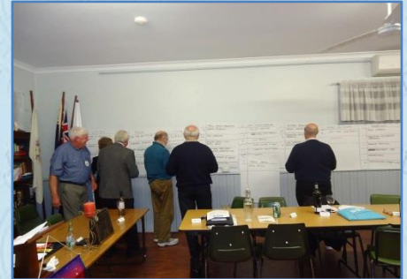
Original workshop Aug 2014

We had however produced a Club Visioning document some time ago which outlined the 5 year goals we had opted for previously but not followed up on.