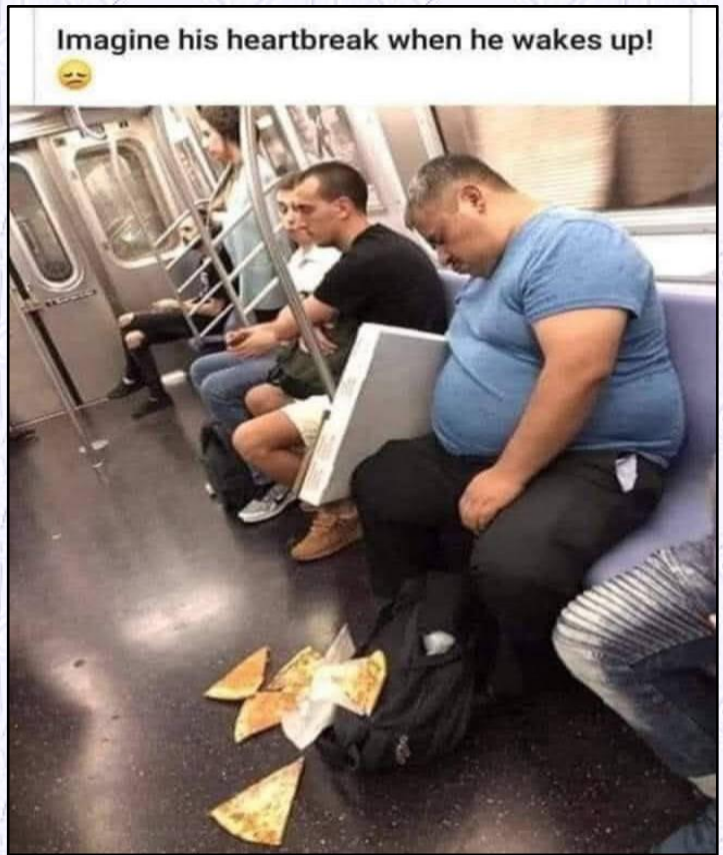
Imagine his heartbreak when he wakes up!