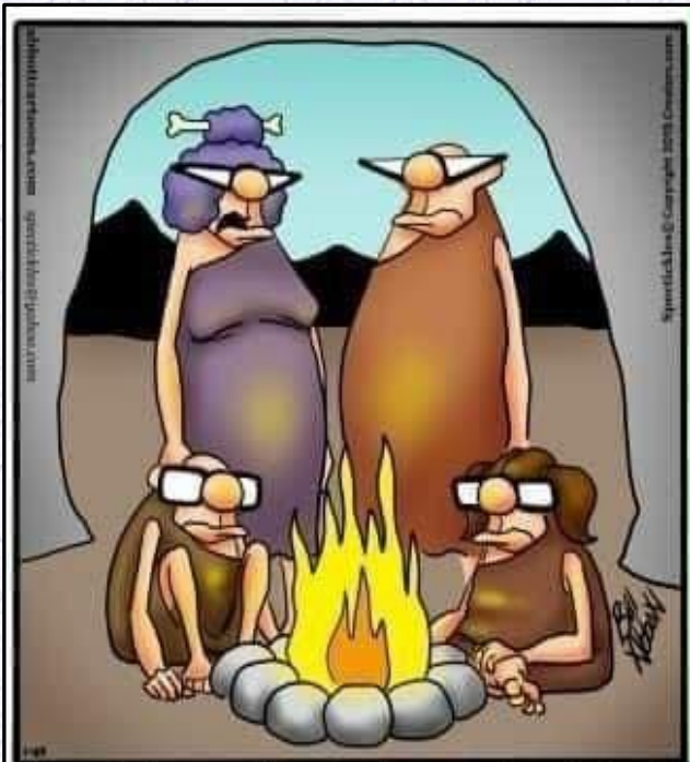
"It can't be healthy for them to be sitting in front of this new technology all day."