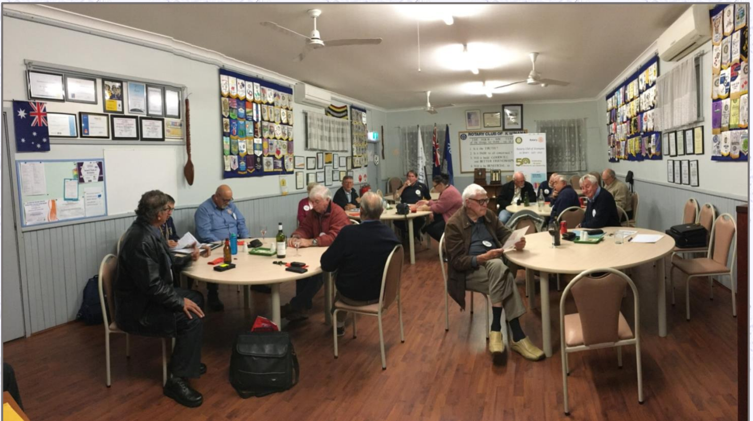
Kwinana Rotary Club meeting, Monday 23 rd May 2022

A Hollywood hostess, giving instructions to a new maid just before a party, cautioned: "Now remember, Marie, when you serve my guests, don't wear any jewellery."