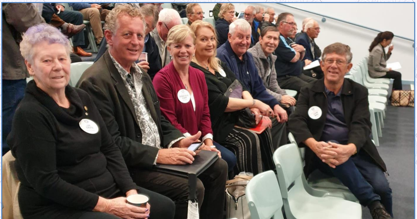
Kwinana Rotarians attending District Assembly last Sunday