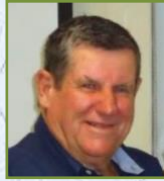
PP Max Bird Foundation Dir.