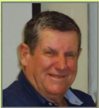
Max Bird International