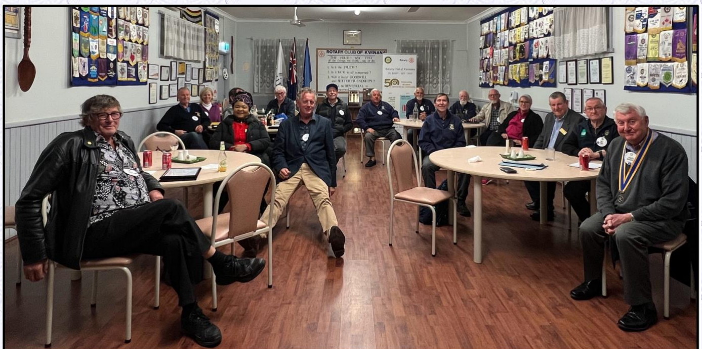
Kwinana Rotary meeting Monday 26 th June 2023 at Rotary Hall