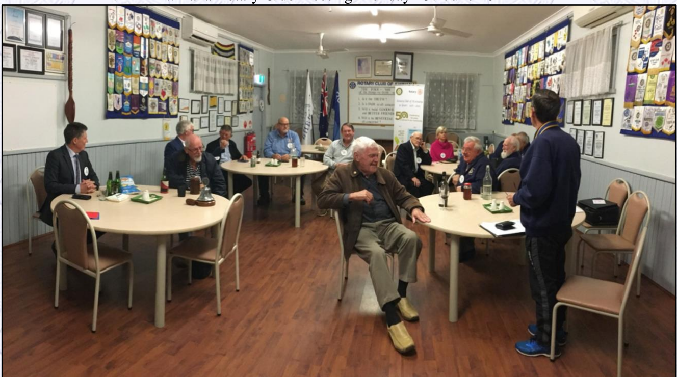
Kwinana Rotary Club meeting Monday 13 th June 2022