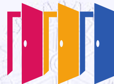
Rotary Opens Opportunities

Rotary Club of Kwinana is 50 th year's old 1971/2021