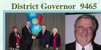
District Governor 9465