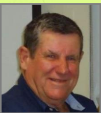
Max Bird International