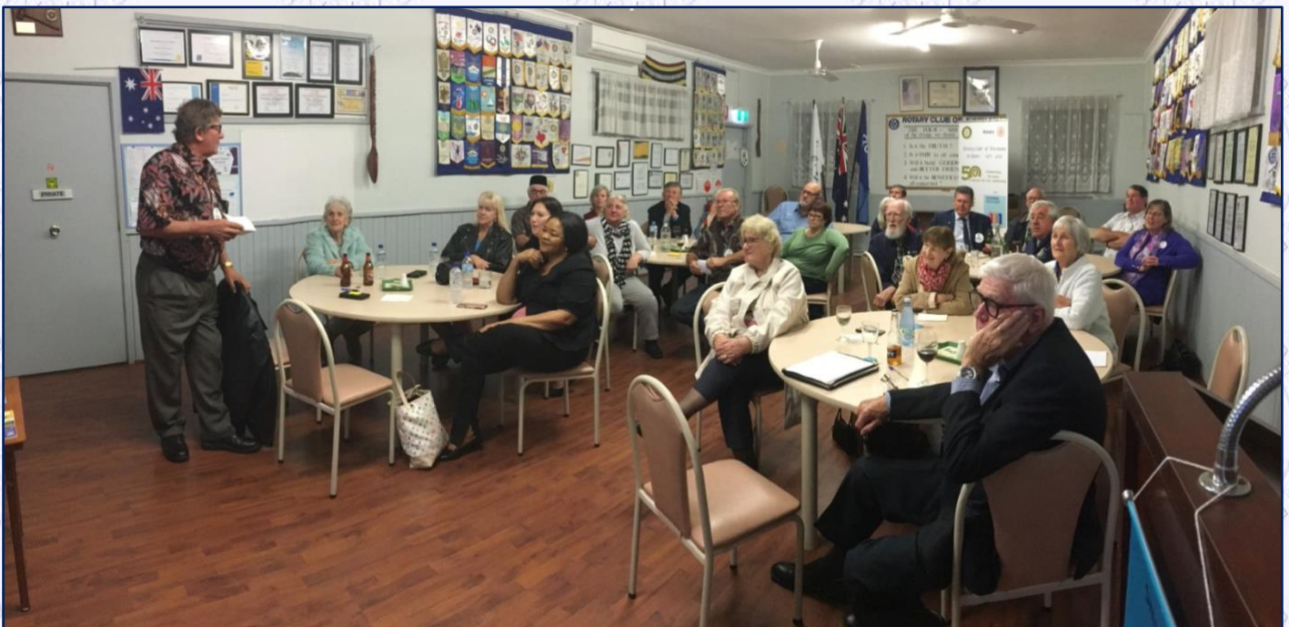
Rotary Club of Kwinana meeting Monday 20 th June 2022