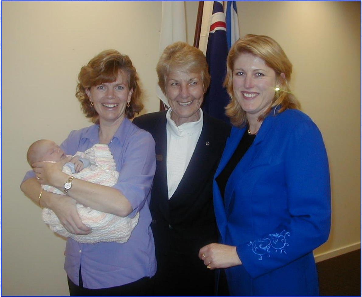
19 th June 2022