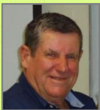
Max Bird International