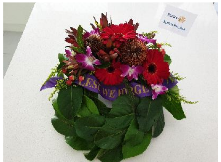
The wreath laid at the Dawn Service in Surfers Paradise from The Rotary Club of Surfers Paradise