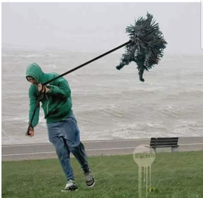
During the past week.