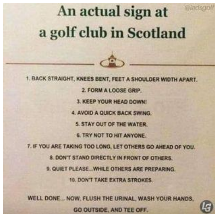
Probably been around before.