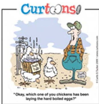
"Okay, which one of you chickens has been laying the hard boiled eggs?"