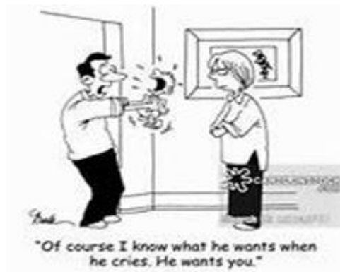
"Of course I know what he wants when he cries. He wants you."