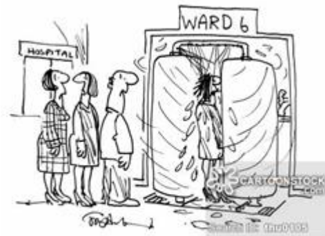
"This hospital certainly takes cleanliness seriously."