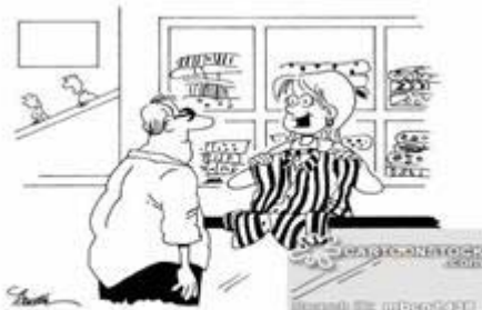
"These pajamas come with a flak jacket sewn into the lining to protect against the 'Stop Snoring' elbow in the ribs."