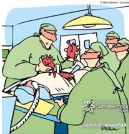
"OK, the old one's in my right hand, the donor's in my left. Right?"