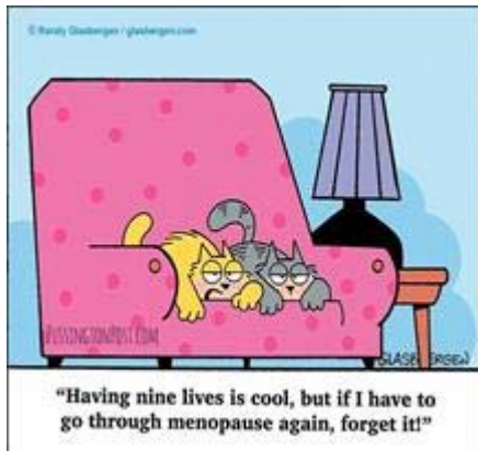
"Having nine lives is cool, but if I have to go through menopause again, forget it!"