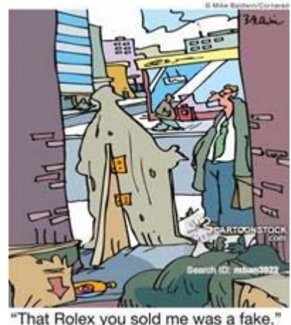
"That Rolex you sold me was a fake."