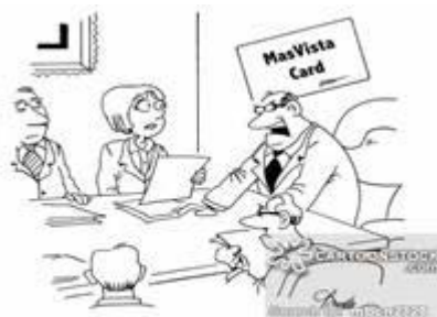
"My 4 year old granddaughter received a credit card offer last week. I want to know why it wasn't ours!"