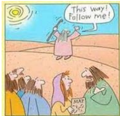
After 39½ years of wandering in the desert, Mrs. Moses secretly asks for directions.