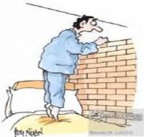
"WELL, WAS IT SOMETHING I SAID?"