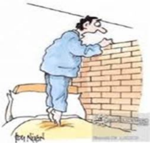
"WELL, WAS IT SOMETHING I SAID?"