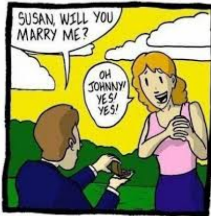
Three-thousand dollars later, it's still the best prank I ever pulled on my twin brother