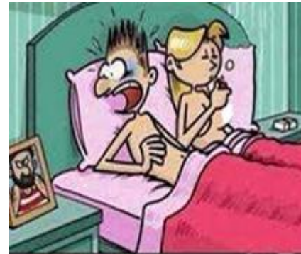
Oh relax silly, that's not my husband. That's me before the operation.