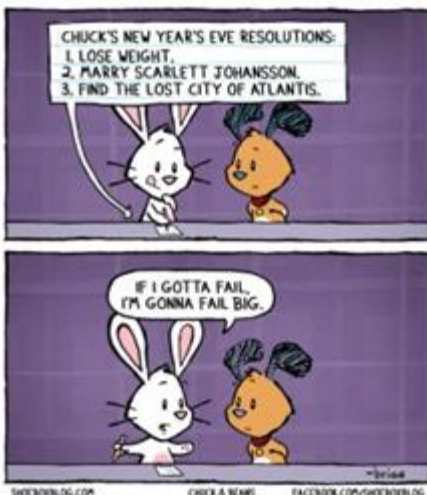
SHOCKBLOG.COM CHUCK & BEANS FACEBOOK.COM/SHOCKBLOG