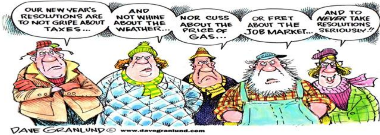
DAVE GRANLUND © www.davegrantlund.com

"And the same people who failed to predict The drop in petrol prices, the Ebola scare, the CIA torture scandal, the Monis terrorist act and Other calamities that swept our Nation in 2014 will now tell us what to expect in 2015".