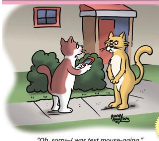
"Oh, sorry—I was text mouse-aging."