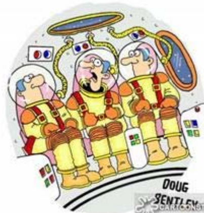
"Abort the mission! I think I forgot to turn my iron off before we left!"