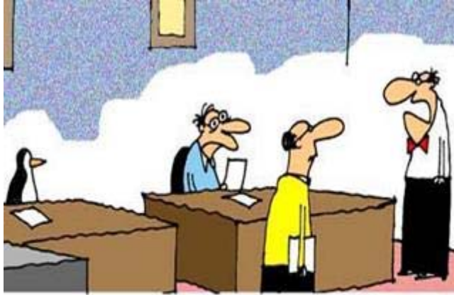
"I don't know which one of you keeps turning up the air conditioning, but you'd better stop!"