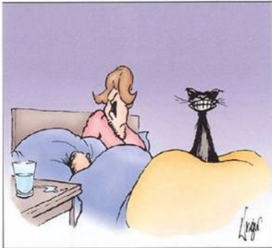
"Wake up. The cat's got your teeth."