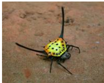
Spiny Orb Weaver Spider, USA