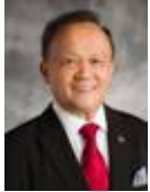
GARY C.K. HUANG

In order to let our members know in advance the subject your guest speaker will be presenting, kindly provide the Bulletin Editor with relevant details at least a week in advance (two weeks preferably) so particulars can be published ahead of time.