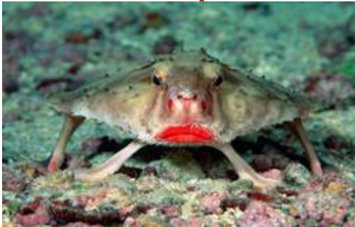
Red Lipped Bat Fish Galapagos Islands