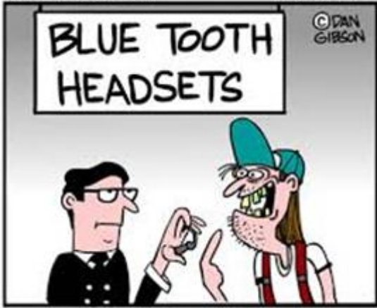
Bluetooth? Heck...I already gots me a bunch of yellor ones... and a couple of green-uns too.