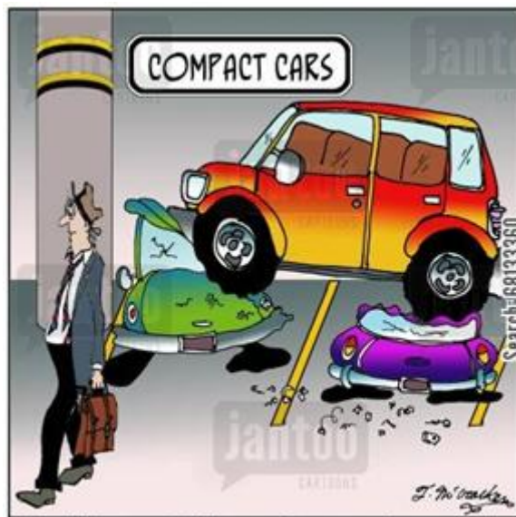
Fred interpreted the word compact as a verb, not as an adjective.