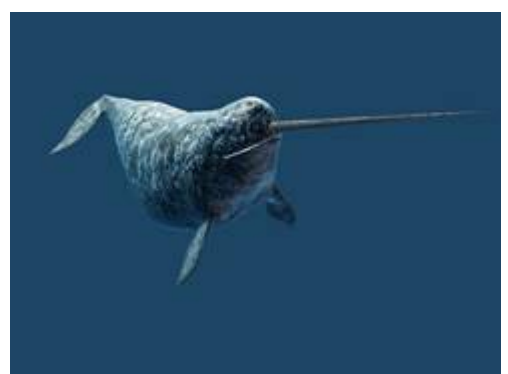
Narwhal is a whale. An uniwhale