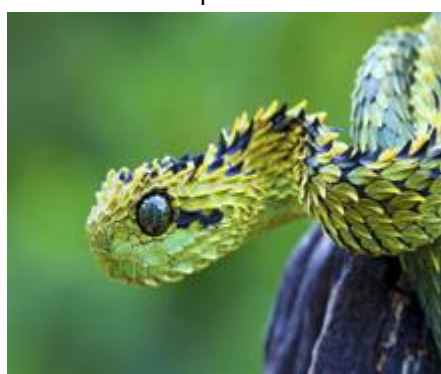
African Tree - Bush Viper