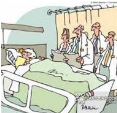
"Male, 38, still living with his parents. They asked us to keep him overnight, so they could change the locks."