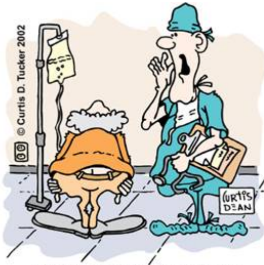
"Yes! That was very loud Sir, but I said I wanted to hear your HEART!"