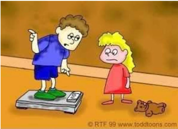
"I think it's called a scale, but mom calls it a @#$% liar!"