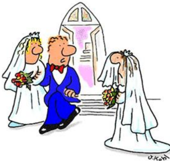
"Didn't you get my e-mail?"