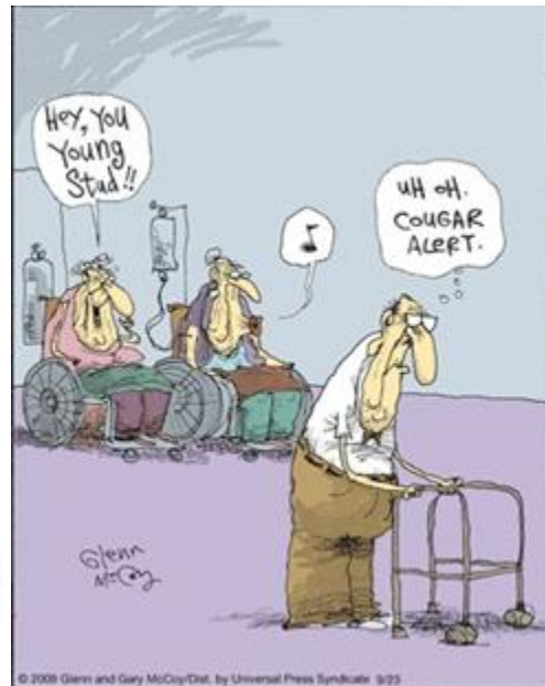
© 2008 Glenn and Gary McCoy/Dist. by Universal Press Syndicate 9/23