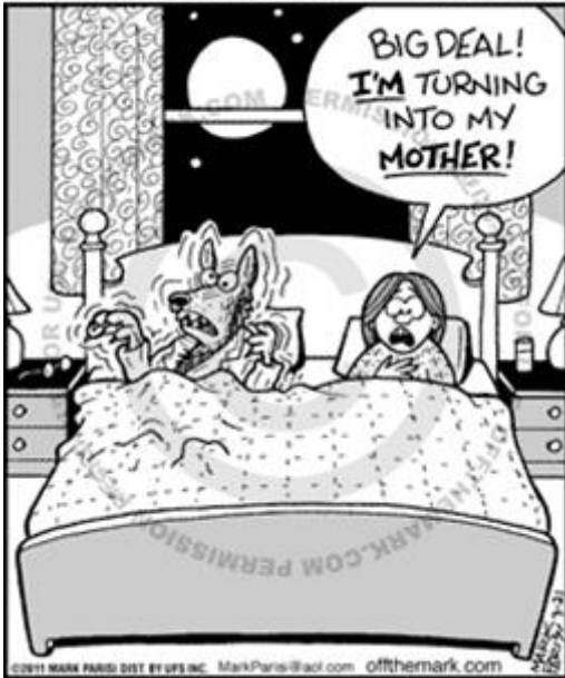
© Mark Parisi, Permission required for use.