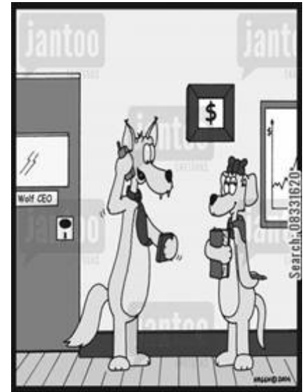
A meeting Thursday night? Hang on... No I can't: It's the full Moon, I'll be out howling with the pack...