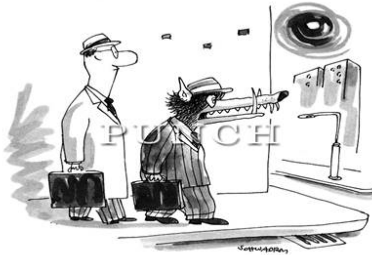
"It's the family curse. Every full moon I turn into an accountant."