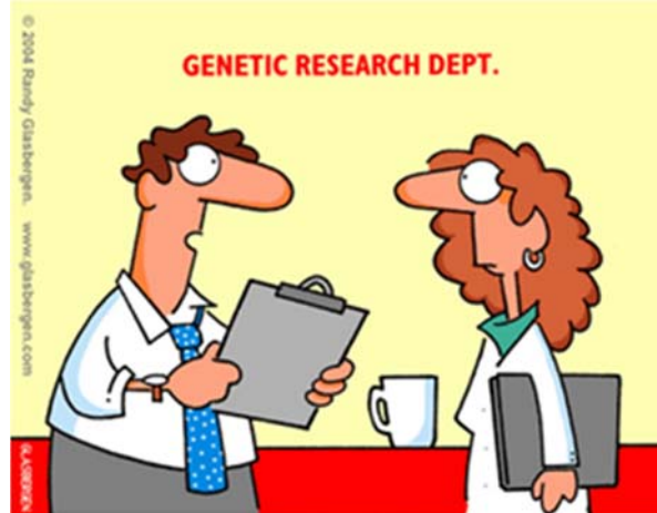
"We need more funding, so we spliced particles from a dollar bill with the DNA of a Holstein. We're hoping to create a cash cow."