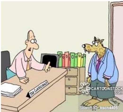
"IT DOESN'T MATTER IF THIS ONLY HAPPENS AT THE FULL MOON. YOU STILL HAVE TO PAY YOUR DOG LICENCE, SIR."