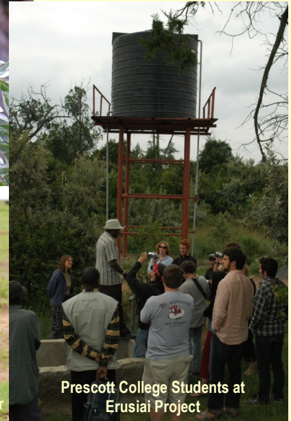
Prescott College Students at Erusiai Project