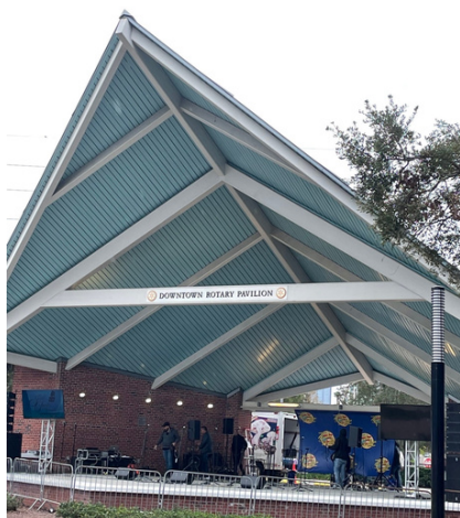
Shelley Hoffman shared this photo of a Rotary amphitheater she saw in Tampa