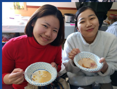
Our youth exchangers