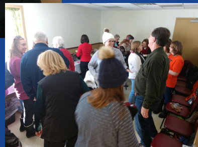
We were a full house!