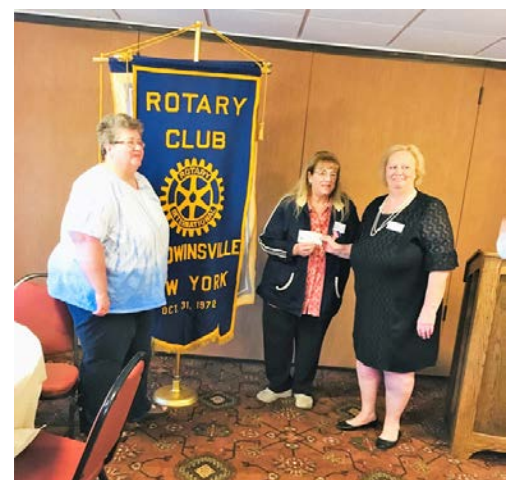
Meg presented a check for $250 to two representatives from the local VFW. The funds will go to their food pantry, which delivers monthly groceries to local veterans!