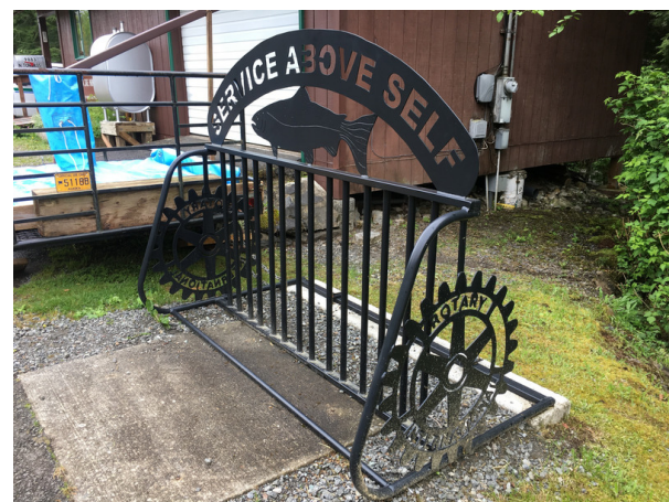
Norma and Stu saw many things that Rotary sponsored on their recent travels, including this really cool bike rack.