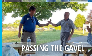
PASSING THE GAVEL