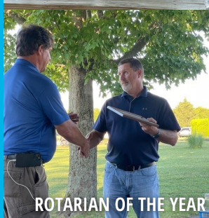
ROTARIAN OF THE YEAR