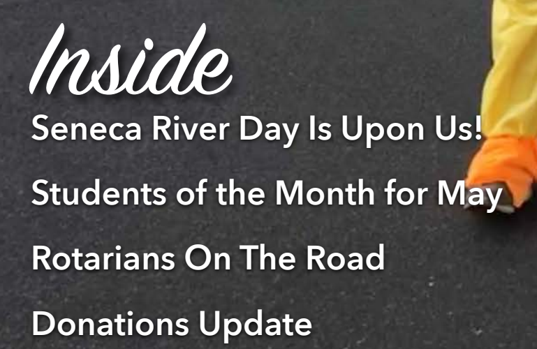
Photo: As part of the club's Memorial Day Parade float, our duck was a big hit with the crowd. Here he rounds Genesee Street, giving a friendly wave.