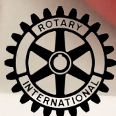
Photo : At Rotary's Chicago Zone Institute, a booth promoting the 2018 Rotary International Convention in Toronto, Canada was feeling ducky!