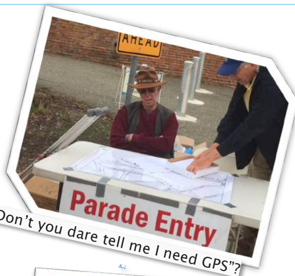
Don't you dare tell me I need GPS?"