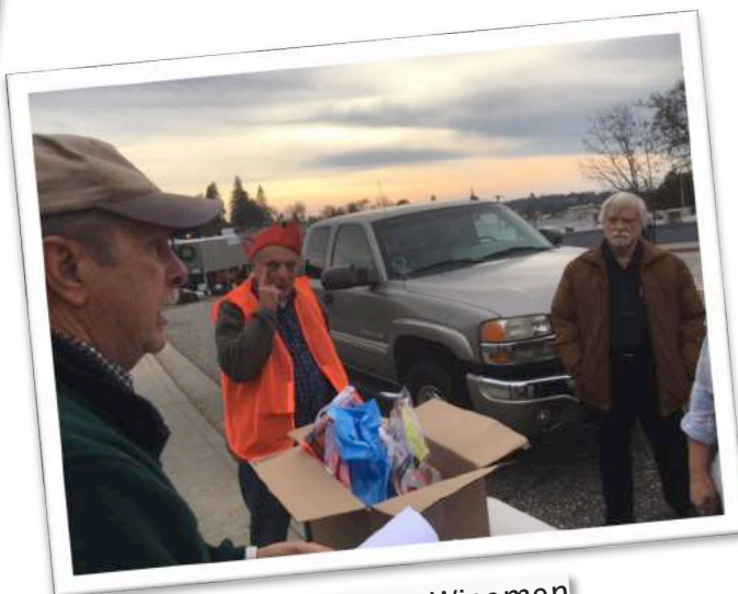
The Three Wisemen