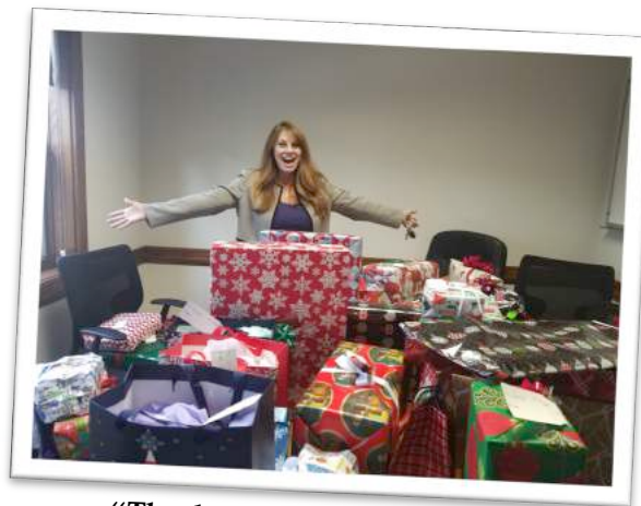
"Thanks for your generosity."