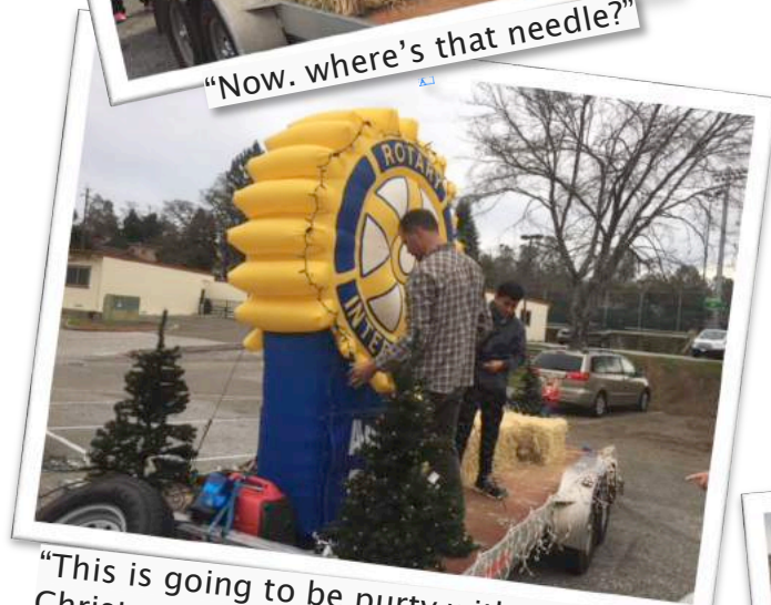
"This is going to be purty with all these Christmas lights."