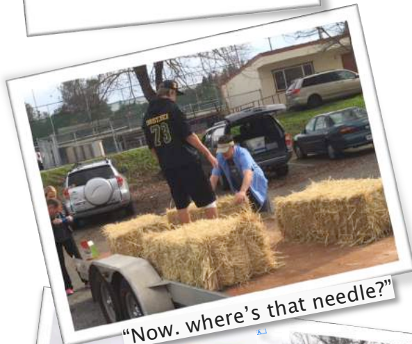
"Now. where's that needle?"