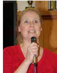
Kendall gave help!