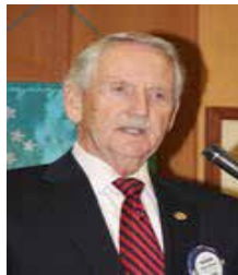
What happened in 2012 & what's going to happen in 2013?