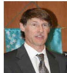
We learned about fracking & selling oil to the Saudis in 2030!