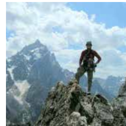
We brought him down from the Tetons! See his new smiling face above!