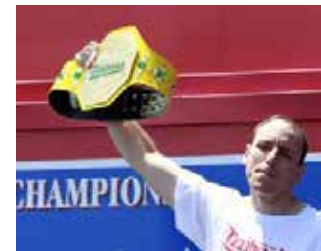
Joey Chestnut of San Jose "ate" 68 hot dogs in 10 minutes and won $10,000 last July 4th at Nathan's Famous Hot Dog Eating Contest—his sixth consecutive win!