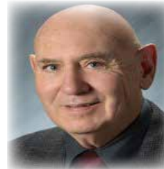
Happy papa gave $100 to RI Foundation for daughter's win!