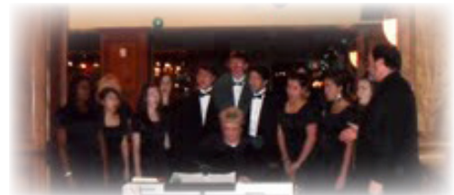
The choir entertained