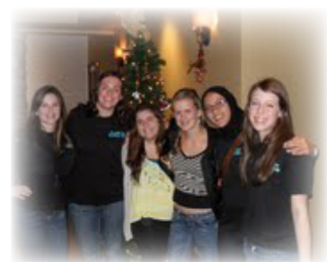
The youth volunteers