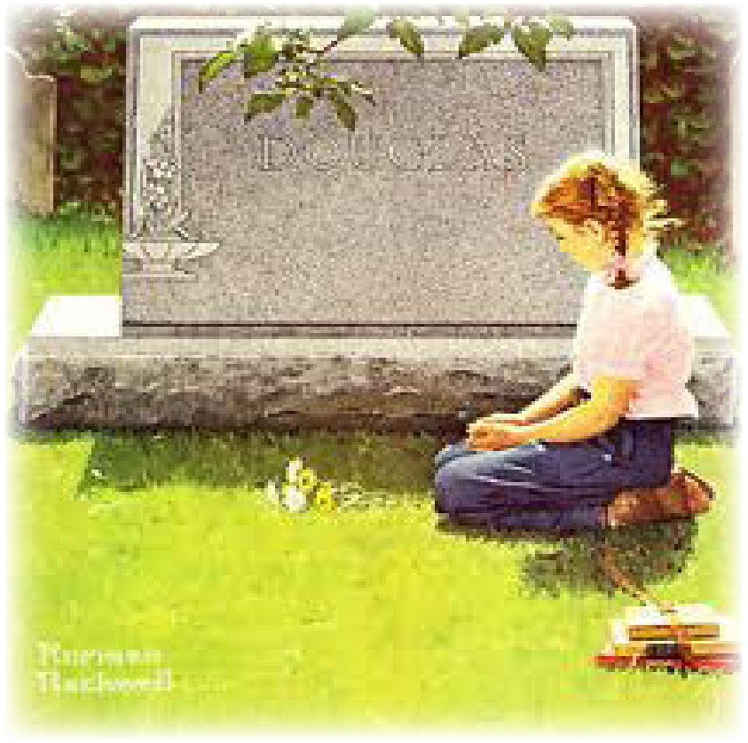
By Norman Rockwell