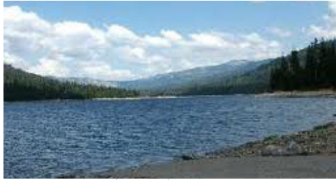
French Meadows Reservoir