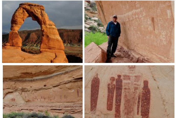
Delicate Arch in Arches National Park. Petroglyph panel in Natural Bridges National Monument. The Great Panel in Horseshoe Canyon, Canyonlands National Park. A close-up of the group in the panel called “The Holy Ghost and His Family.”